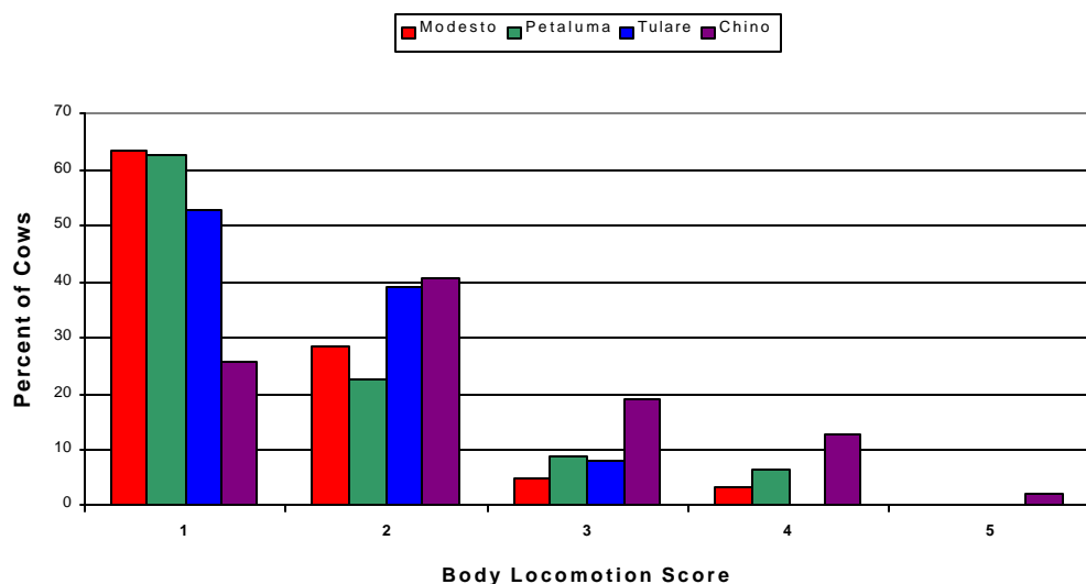
Figure 1. High group locomotion profiles for four commercial California dairies.

It is realistically impossible to achieve no lameness in a herd, if any cow locomotion scoring over 1 is considered to be expressing some degree of lameness. Nevertheless, the LS profiles shown in Figure 1, for high production groups on four commercial herds in California indicate, that it is possible to eliminate clinical lameness (i.e., LS of 4 and 5), as that was the case in the Tulare herd. A reasonable goal might be to have greater than 65% of cows scoring 1 with less than 3% scoring 4. Cows with LS of 5 should be immediately removed to hospital corrals, if for no other reason than their welfare.